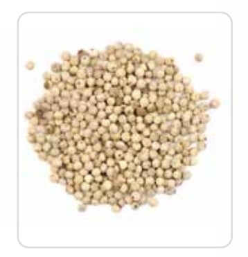
Organic white pepper

Our products are certified by the international body Control Union Certifications which enables us to export to the European market, USA, Japan, and Canada.