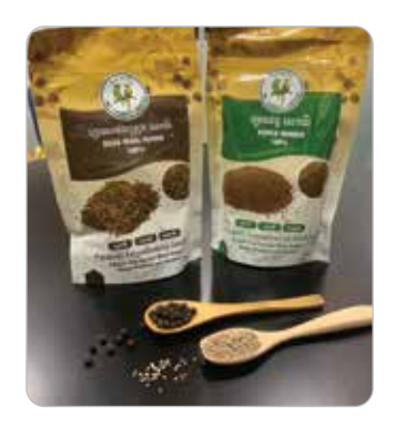
Diced Pearl Pepper and Pepper Powder