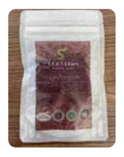
Kampot red pepper