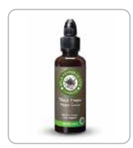
Sauces and spreads