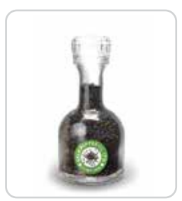
Grinders and refill