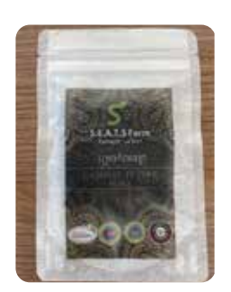
Kampot black pepper