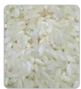
Organic white rice