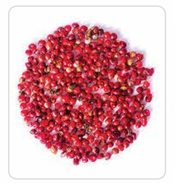
Organic red pepper