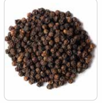
Organic black pepper