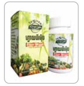
Vitamins and supplements

We believe that supporting farmers who comprise the largest group in the Cambodian agriculture business is the way to improve their economic conditions, enhance their well-being and increase their commitment to sustainable farming.