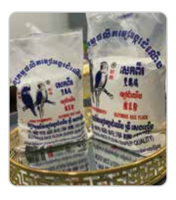
Glutinous rice flour