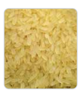
Organic parboiled rice