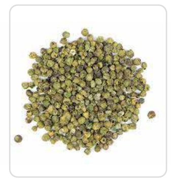
Organic green pepper